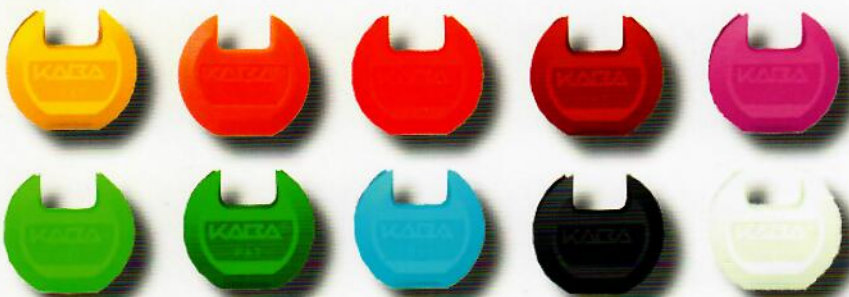
12 different coloured key clips