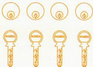
Keyed To Differ