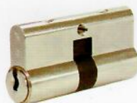
Euro Double Cylinder

Suits: Fixed cam applications. Also available with floating cam