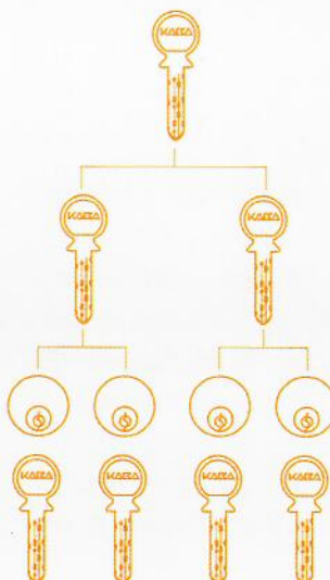
Grand Master Key System

• Temporary Construction Keying : Locks are keyed alike for the builders convenience and security for the owners. When the building is completed the construction cylinders are removed and final cylinders installed.