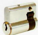
Euro Single Cylinder

Suits: Kaba K Series, KL Series, LK Series and 3000 Series Lock-sets